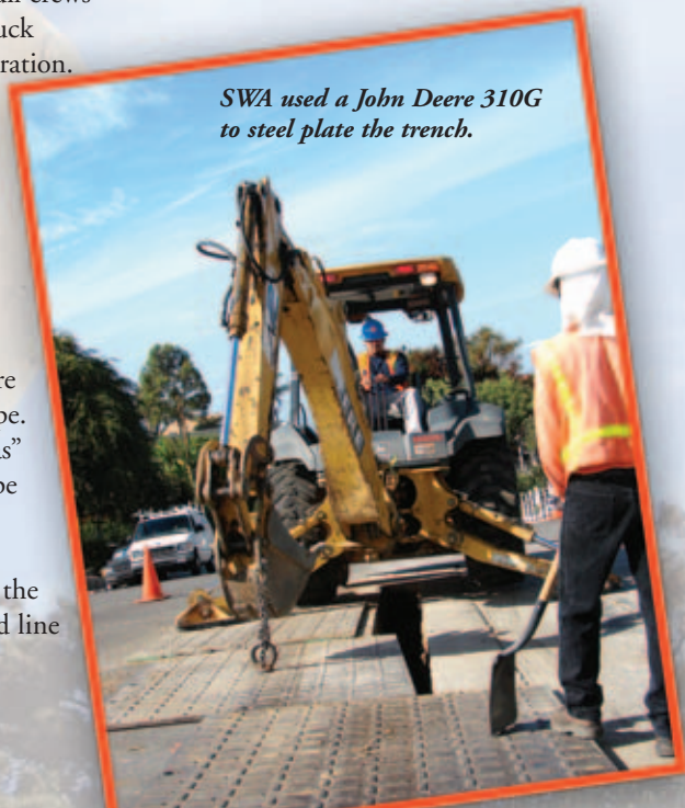
SWA used a John Deere 310G to steel plate the trench.

Using plastic pipe as opposed to steel is another major time and job saving factor. When steel lines are used, a pressure control fitting must be installed in order to shut off the gas so that repairs can be completed. Plastic pipelines allow the